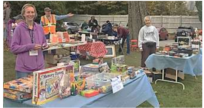
Last year's Yard Sale